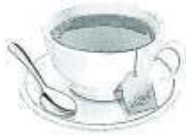
Tea Room 11am-2pm